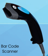
Bar Code Scanner